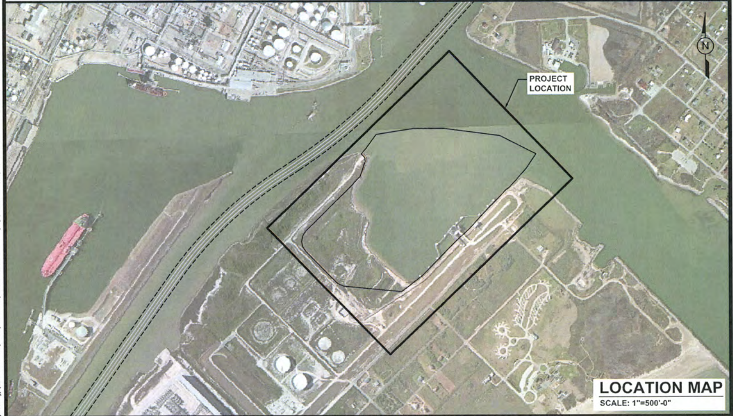
LOCATION MAP SCALE: 1"=500'-0"